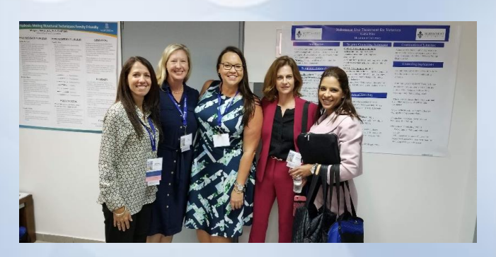
Counseling Faculty attending the European Branch of ACA conference in Athens, Greece