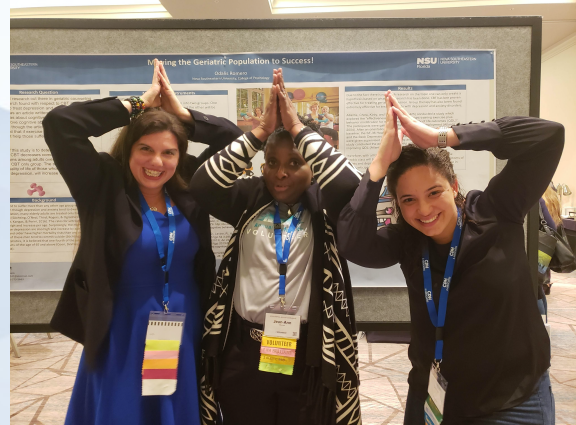
Miami and Orlando Regional Campus Students presenting and volunteering at the Florida Mental Health Counselor's Association conference