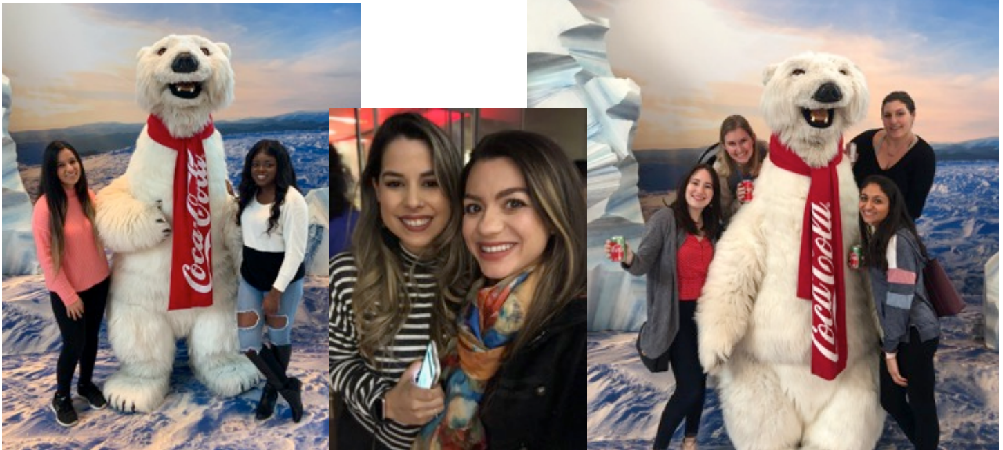
While in Atlanta, many of our students took a break from the conference and explored the city, visiting sites such as the Georgia Aquarium and the World of Coca-Cola!