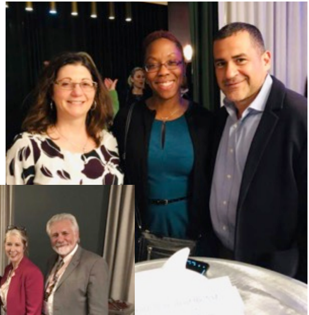
Some of our faculty, friends, students, and alumni enjoying the NSU College of Psychology Alumni & Friends Reception as well as sharing other experiences throughout the conference!